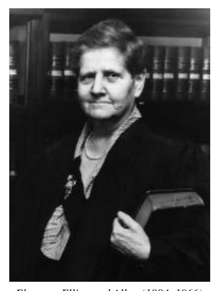
Florence Ellinwood Allen (1884–1966)

As a state supreme court justice, Allen decided numerous legal issues reflecting Ohio's importance to the nation's increasingly industrialized economy. Generally supportive of organized labor, she issued many decisions favorable to aggrieved employees, including a decision construing the state Workman's Compensation Act broadly to preserve an employee's action against an employer who failed to comply