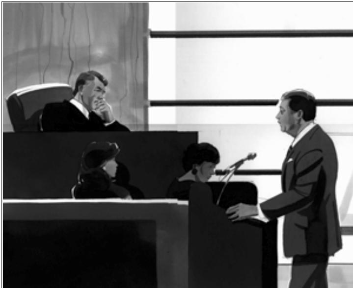
Judge listens to attorney's argument (note courtroom deputy and court reporter)

The courtroom deputy or clerk. The courtroom deputy or courtroom clerk , who is usually seated near the judge, administers the oaths to the witnesses, marks the exhibits, and generally helps the judge keep the trial running smoothly. Sometimes the deputy or clerk is away from the courtroom performing other tasks during parts of the trial. The courtroom deputy is employed by the office of the clerk of court . The clerk of court is appointed by all of the judges on the court and works closely with the chief district judge , who is responsible for the court's overall administration.